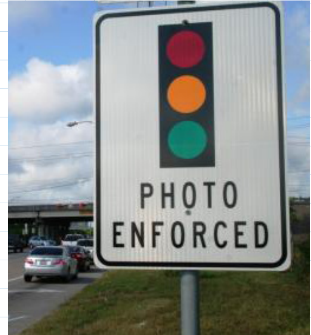
PHOTO ENFORCED RED-LIGHT RUNNING PROGRAM