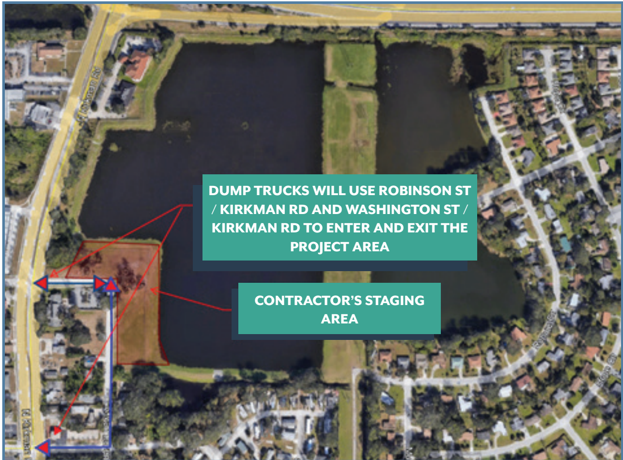
Figure 2 - Haul Routes