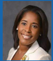
DISTRICT 6 COMMISSIONER VICTORIA P. SIPLIN