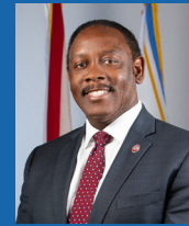
ORANGE COUNTY MAYOR JERRY L. DEMINGS

FROM DESTINATION PARKWAY TO UNIVERSAL BOULEVARD